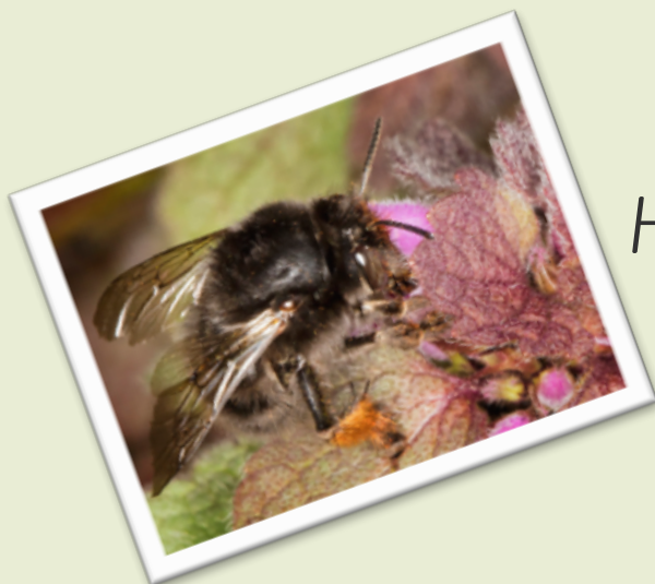
Hairy footed flower bees