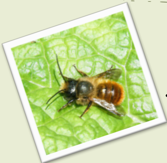
Red Mason bees