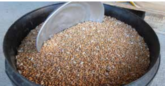
Spreading food by hand or by automatic spinners allows any location to be reached.