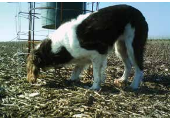
Choose feeder locations close enough to tracks but away from disturbance.

The PCS is a free and voluntary scheme run by the GWCT since 1933 to collect information on the annual abundance and breeding success of grey partridges. If you are a farmer, landowner, game or other land-manager who wants to improve wild grey partridge numbers, please join the scheme. For more information or to sign up go to www.gwct.org.uk/partridge .