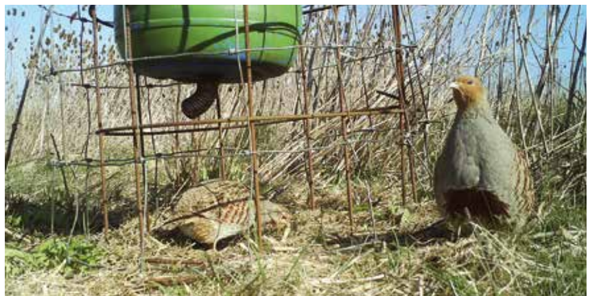
In spring, well-managed feeders help grey partridge pairs to establish their breeding territories.