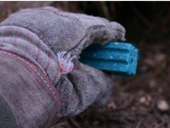
Training is compulsory if you use rodenticides at active rat holes away from farm buildings.

In the UK, training is now required for anyone intending to control rats with professional rodenticides away from farm buildings. We recommend attending our rat control course for gamekeepers (see box).