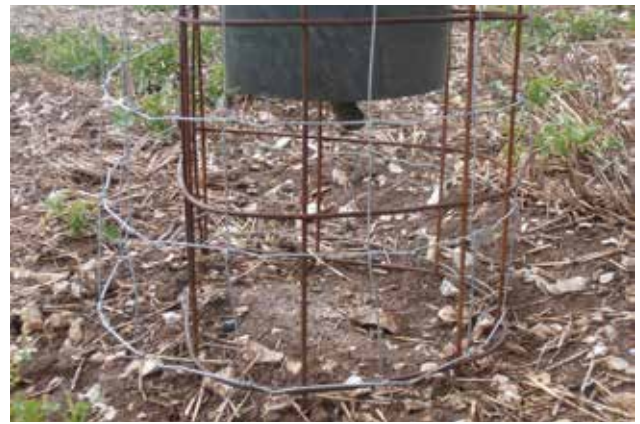
(Top). The drum must be attached to the frame and well fixed to the ground otherwise it will be easily knocked over by wildlife, especially deer (see photos below).