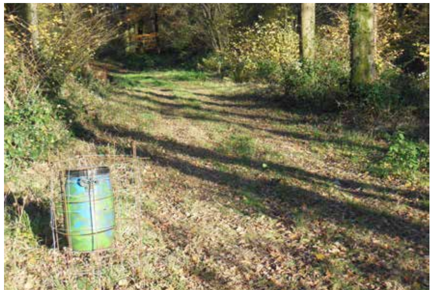
Place feeders for pheasants along woodland rides.