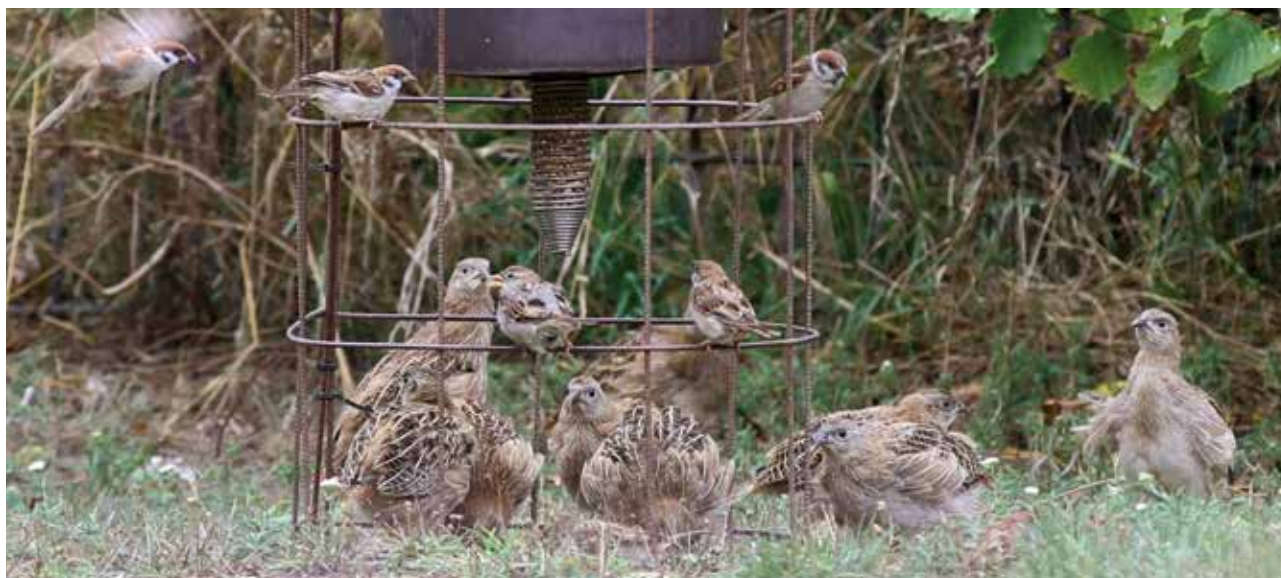
A grey partridge brood and tree sparrows at a feeder set during the breeding season specifically for wild partridges.