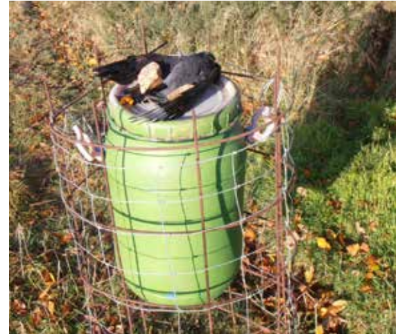
Dead corvids used as 'scarecrows' reduces the number of unwanted corvid visits, but can also deter songbirds.