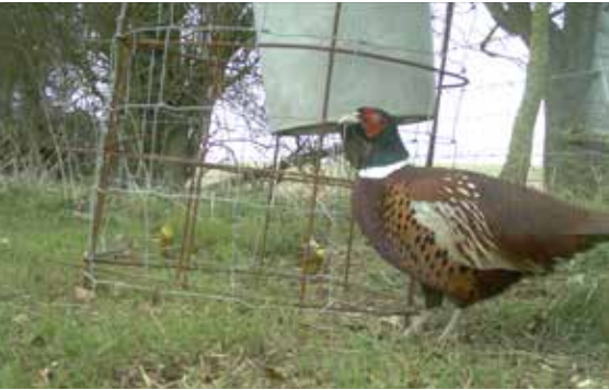
Hopper feeders can store grain during prolonged periods of time which reduces manpower compared with hand-spreading.