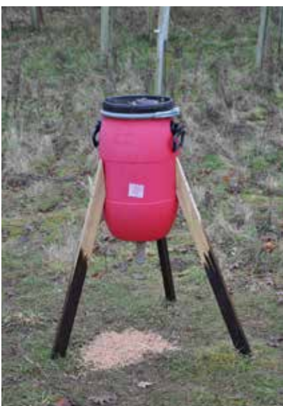
Height: 40-45cm (16-18")