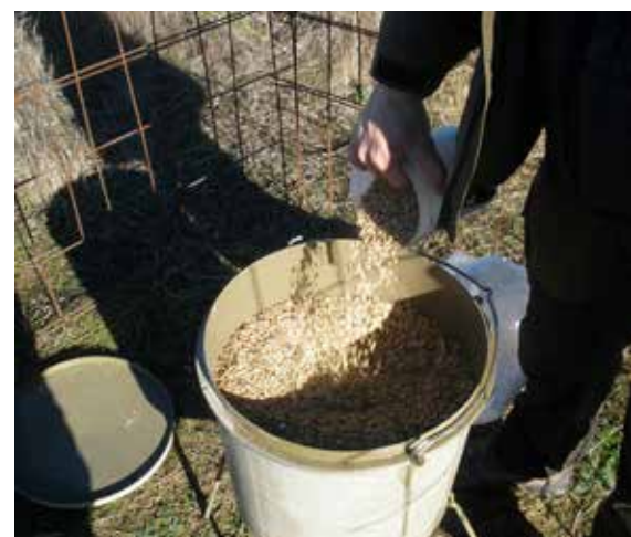
Use a bucket of 5-10 kg as your 'unit of measure'.