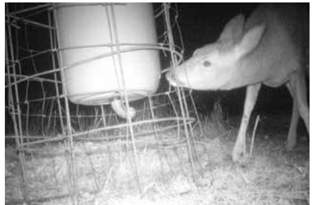
(Bottom). Nailed feeders may be useful in farms with high deer density (left), but we recommend a movable well-framed feeder with excluders, if possible (right).