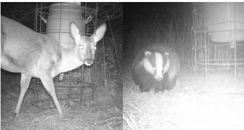
A mesh with a size from 12 x 12 centimetres to 20 x 20 centimetres will discourage deer and badgers.