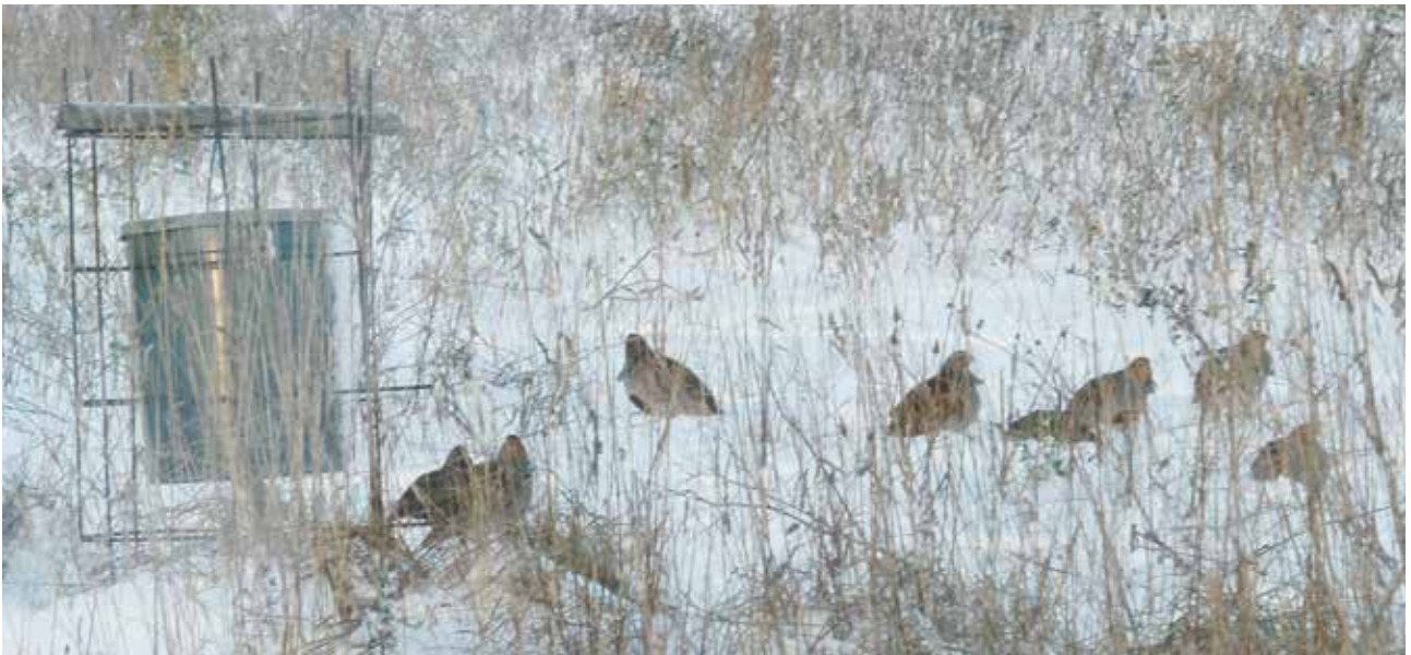
A covey of radio-tagged grey partridges close to a feeder during a snowy winter, when feeding is needed the most.