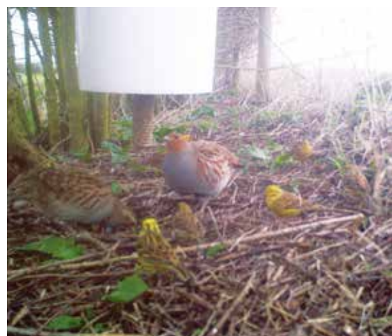
Feed wheat if you are targeting gamebirds like grey partridges and songbirds like yellowhammers.

Use wheat if the main management aim is gamebirds, yellowhammers and corn buntings. If also targeting other seed-eating songbirds of conservation concern, use a similar seed mix as described above, and remember that smaller seeds need to be provided using feeders specifically designed for this purpose (see Figure 4, page 13). Some songbirds prefer to feed on the ground, so also broadcast some seeds and grain on farm tracks and in wild bird covers.