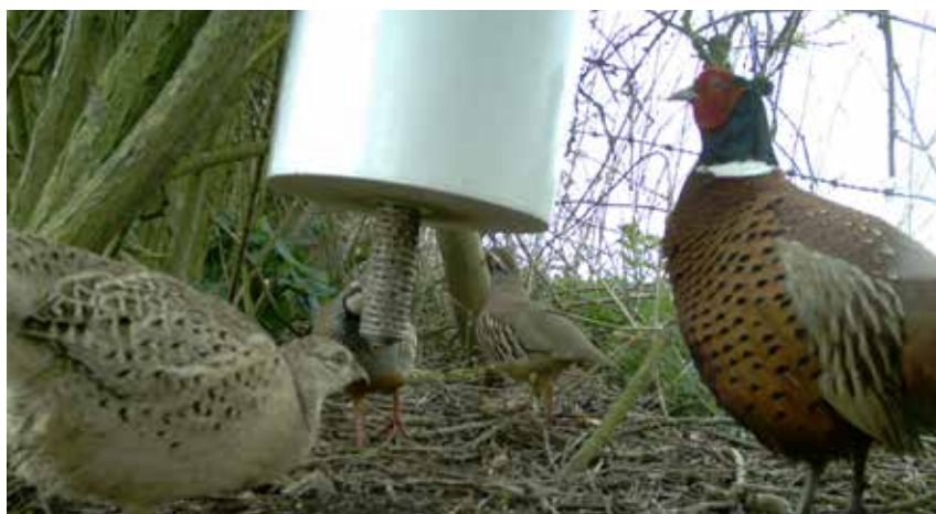
Pheasants and red-legged partridges are the most common gamebirds in Britain to benefit from winter feeding.