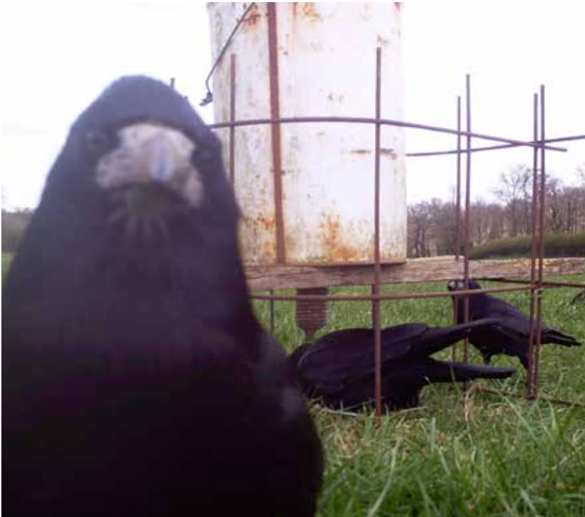
(Left) Corvids can visit feeders frequently.