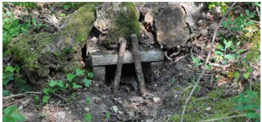
Excluder sticks set in a tunnel trap to reduce non-target captures.

We have joined forces with the Campaign for Responsible Rodenticide Use (CRRU) and BASIS Registration Ltd to offer a rodenticide training course which will include the necessary certification for successful candidates to go on buying and using professional rodenticides after a product authorisation change on 1 July 2016. For more information, please contact our Advisory team by email advisory@gwct.org.uk or 01425 651013.