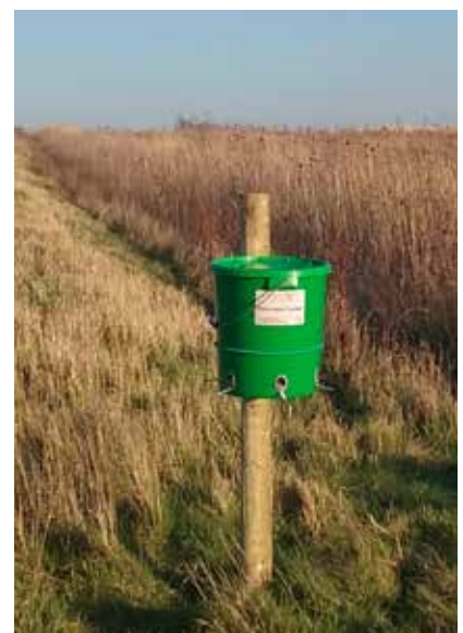
Around one metre above ground