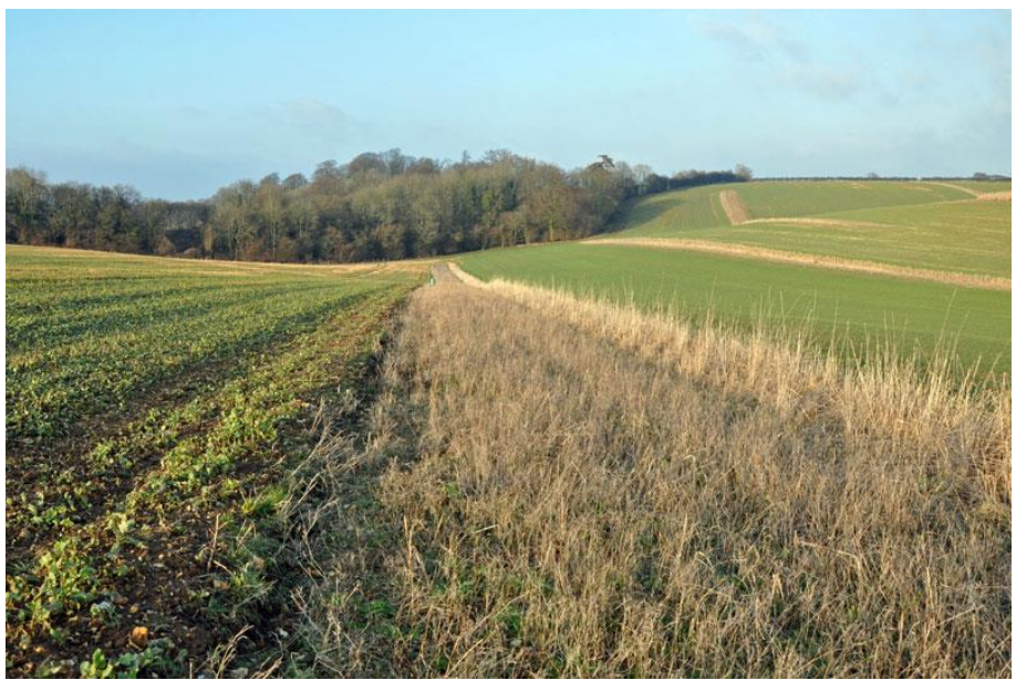
The use of Integrated Pest Management techniques, for example beetle banks, can minimise the use of chemical pest and weed control.

A: Commercial, large-scale agriculture needs pest control. The cost of crop production per hectare is high, and sometimes the inability to use pest or weed control would render the production of food unviable. The use of Integrated Pest Management techniques, for example beetle banks, can minimise the use of chemical pest and weed control, but insecticide use may be necessary to protect a crop when these techniques fail.