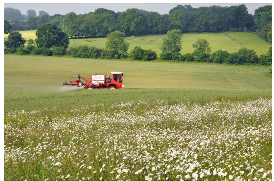
Conventional spraying is less targeted, resulting in treatment leaching through soils and into water courses.

A: One benefit of the concept of seed dressing is that it should target only those pests that consume the plant, rather than a spray where the chemical is introduced to the wider environment. However, evidence shows that only a small amount of the treatment coated on the seed is absorbed by the plant, with the residual retained in the soil or leached through field drainage systems to water courses. The potential effects of this on soil organisms and other species requires further study.