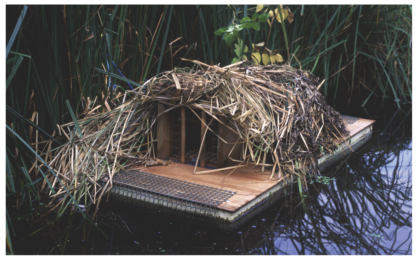
The GWCT Mink Raft

All culling will have some impact on mink population size, but ecological consequences may perhaps be trivial if some mink are still present after trapping, or if removed animals are quickly replaced through reproduction or immigration. As yet, we don't know what level of mink abundance - if any - is low enough to allow persistence of different prey species. In the absence of such knowledge, the aim of most control efforts is currently to ensure complete absence of mink on a local or wider scale. The GWCT Mink Raft provides a method of monitoring presence or absence of mink at specific sites that is independent of the trap itself. In preexisting trapping strategies, the continued presence of mink at removal sites (or elsewhere) could be monitored only by field signs, direct sightings or further trapping. All of these are less sensitive than the raft method.