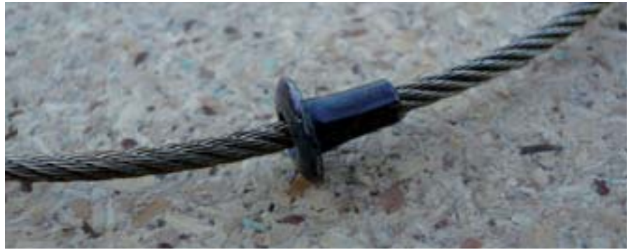
One kind of fixed stop, which prevents the noose closing too far.

by night shooting. The smallest noose we could force over the head of the smallest (4.0kg) adult vixen was 25cm in circumference. Ninety five percent of the adult vixens we measured had heads bigger than this. In practice, it seems that live foxes do not pull as hard as we did, perhaps because their ears get in the way. Given a stop set at 26cm, the smallest fox retained during the course of the trial was a juvenile vixen of 3kg.