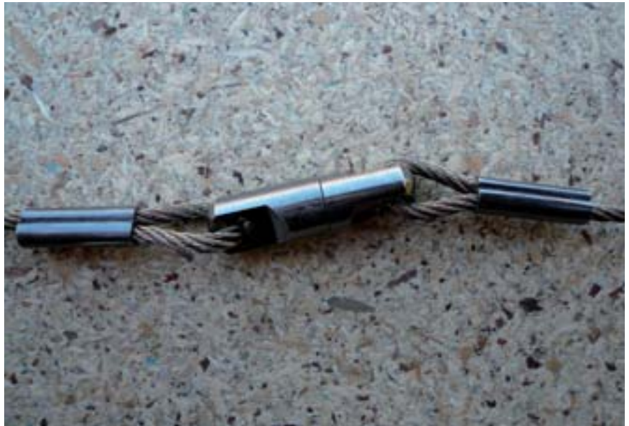
A quality mid-point swivel: small, strong and rotates easily under strain.

We like neat, small swivels: a bulky mid-point swivel spoils the natural line of the snares and makes an obvious and ugly visual distraction. However, experience