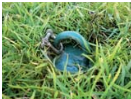
Corkscrew anchor in position.

the captive winding the snare around it. Do not attach snares to posts or natural objects such as trees or saplings – this encourages entanglement which may result in injury or death.