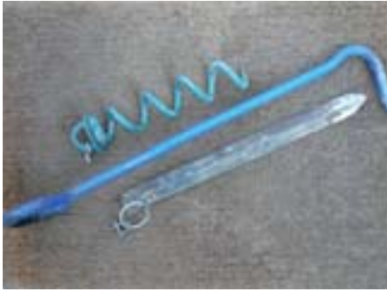
Two kinds of anchor: angle iron stake (below) and corkscrew (above). The man-hole cover lifter (centre) makes an excellent extraction tool for both anchors.

Anchor: The snare anchor must be effective at holding not only a fox, but any non-target animal that might be caught. There is no single anchor type that will suit all ground conditions. For the majority of conditions, we recommend a 450mm x 25mm length (18" x 1") of 5mm thick angle-iron, driven into the ground. An 8mm hole should be drilled 50mm from the top, in the middle of one side of the angle iron. Connect a 50mm diameter welded ring to a D-shackle, and fix the shackle to the stake via the drilled hole. The snare should be attached to the ring, with another D-shackle. This arrangement acts almost like a universal joint and is unlikely to foul the anchor. Whenever you use D-shackles, make sure they are tightened using pliers.