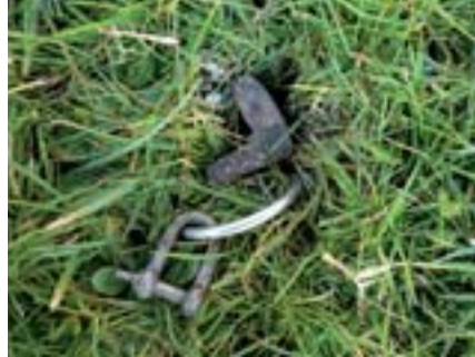
Angle iron anchor stake in position.

as on moorland. We do not recommend the use of smooth metal rods – these can easily be pulled out, especially when the ground is wet. Whatever type of anchor you use, the top of it should be more or less flush with ground level, to prevent