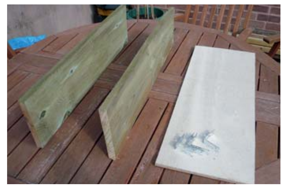
Cut four 100mm lengths of fixing strap and bend each strap then open back out to form right angles.

The tunnel's dimensions need to take account of the type of trap you intend to use. This guide assumes the raft operator will be using a Rhemo Products live catch cage trap. (The dimensions of a Rhemo trap are 600mm long x 180mm wide x 160mm high.) Cut two 660mm lengths of 25mm x 75mm gravel board. These two pieces will form the tunnel sides. Next cut a sheet of 10mm plywood to give you a piece 660mm long x 250mm wide. This will form the tunnel roof. To attach the tunnel to the raft use off-the-shelf right-angle brackets, or if you're making a large batch of rafts consider making your own. If the latter, using a pair of tin-snips, cut four 100mm lengths of fixing strap. Bend each strap across the middle so that the two ends align. Open the straps back out to form right angles.