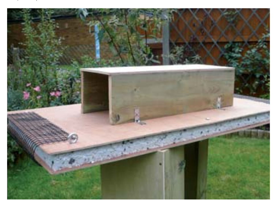
The finished product.