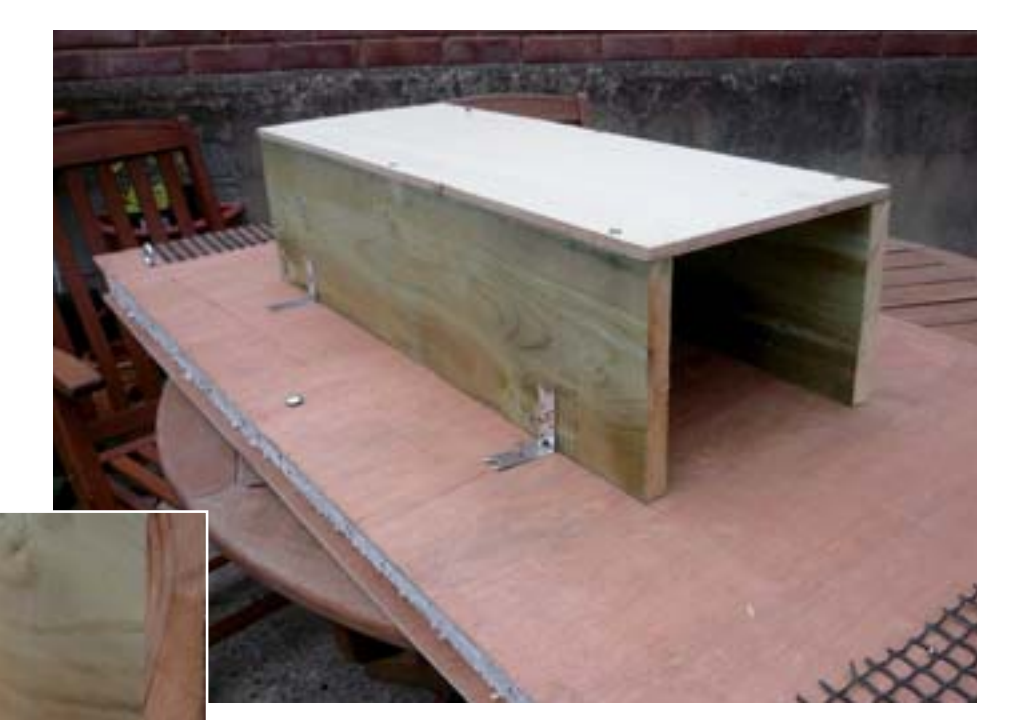
Attach the tunnel to the raft using right-angle brackets.

To finish your mink raft, place the tunnel directly over the raft window. Check the internal sides of the tunnel are equidistant and parallel with the sides of the window, and the tunnel entrances are equidistant from the raft-ends. Set four right-angle brackets 100mm from the tunnel entrances, and fix the tunnel to the raft using 25mm screws.