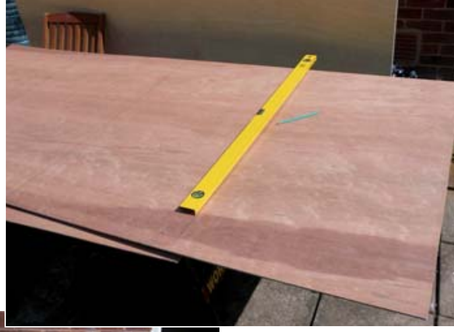
Split your sheet into four equal quarters 1220mm \times 610mm.

Rest your sheet of 6mm plywood across a stable work-station. Unless your work-station is large, you will need to support the sheet at either end. Using a straight-edge, measure and mark cut-lines on the sheet, splitting it into four equal quarters. Each quarter should measure 1220mm x 610mm. Using your cramps, fasten the sheet of plywood to your work-station. Before you saw through them, check that your cut-lines are sufficiently proud of the work-station and away from any electric cables. Cut the sheet into four quarters. (If you plan only to make one raft, you will only need to cut two quarters.)