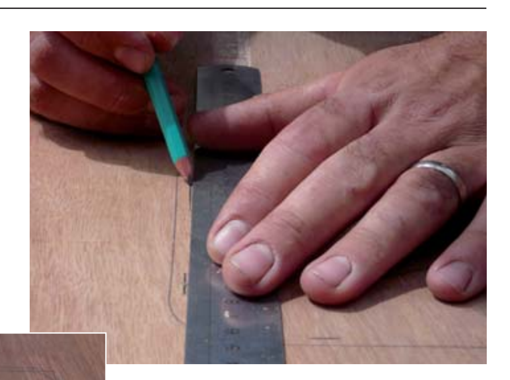
{\it Mark 5mm inside of the basket outline for your cut-line}.

On the inside of the basket outline, use a ruler to mark lines 5mm from the outline. Use a ruler to connect these lines. You will need to draw the rounded corners carefully by hand, or by using the handy basket's rounded corners as a template. The outline of your 'new' rectangle with rounded corners, should be perfectly parallel with the original basket outline. The new line is your cut-line. (When you cut this piece of plywood out, and drop the basket through the window you have created, the basket will suspend itself by hanging from its upper perimeter lip.)