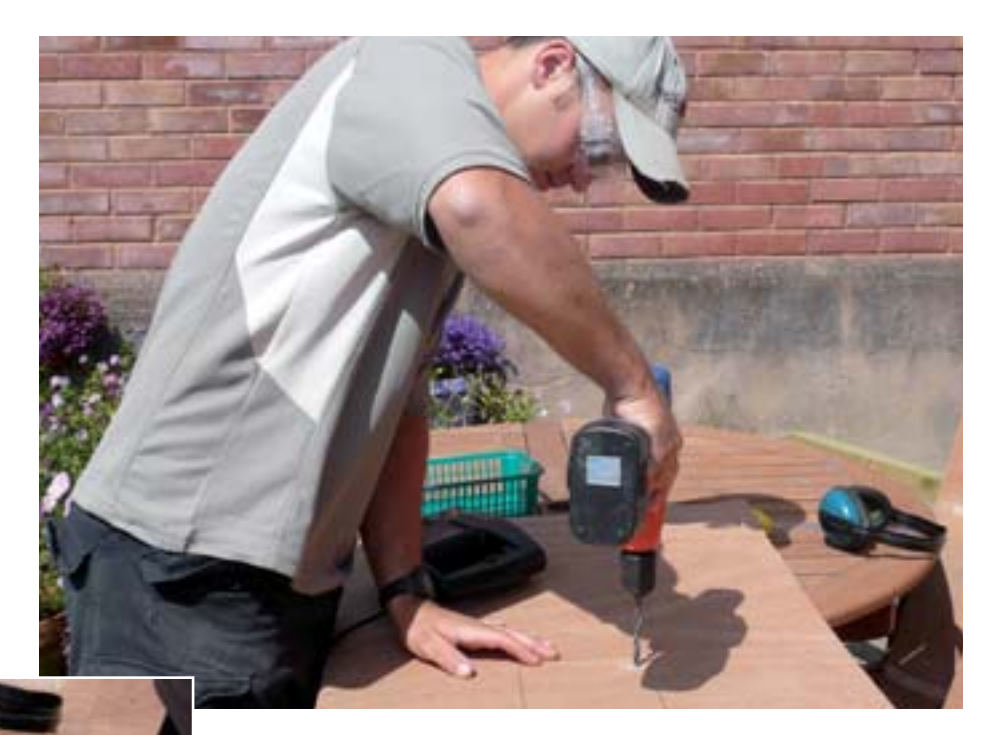
(Above) Drill a pilot hole to insert the jigsaw blade. (Left) Use your jigsaw to cut a window in your sheets of plywood.

With your cut-line uppermost, lay the sheet on top of another quarter plywood sheet. Align the two sheets and grip them together using cramps at both ends. Drill a pilot hole through both sheets, just inside the window cut-line. (Make sure you don't drill through anything you don't want to!) The hole should be wide enough to accept the blade of your jigsaw. Plywood splinters easily, so it is best to use a fine-toothed jigsaw blade or one specially designed for cutting curves in plywood. Carefully following your cut-line, use your jigsaw to cut a window in both sheets of plywood. (Make sure the blade of the saw is clear of any support or wire cables before you start.)