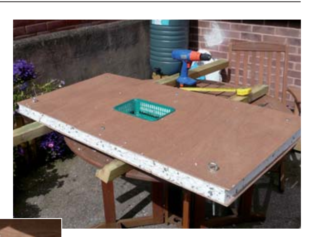
(Left) Cut out the polystyrene rectangle and (above) fit your handy basket in the window.

Use a sharp knife to cut out the polystyrene rectangle visible through the plywood windows. To make a clean cut, push the knife blade right through the polystyrene sheet and cut along the window edge carefully. (Make sure the knife blade is clear of the work-station before you start cutting.) Knock the cut piece out and check that your handy basket fits the window. The basket should fit in snugly (but not tightly) and suspend itself from its perimeter lip. Finally, use sandpaper to remove the rough edges and splinters around all the sawn edges. You are now ready to make the raft tunnel.