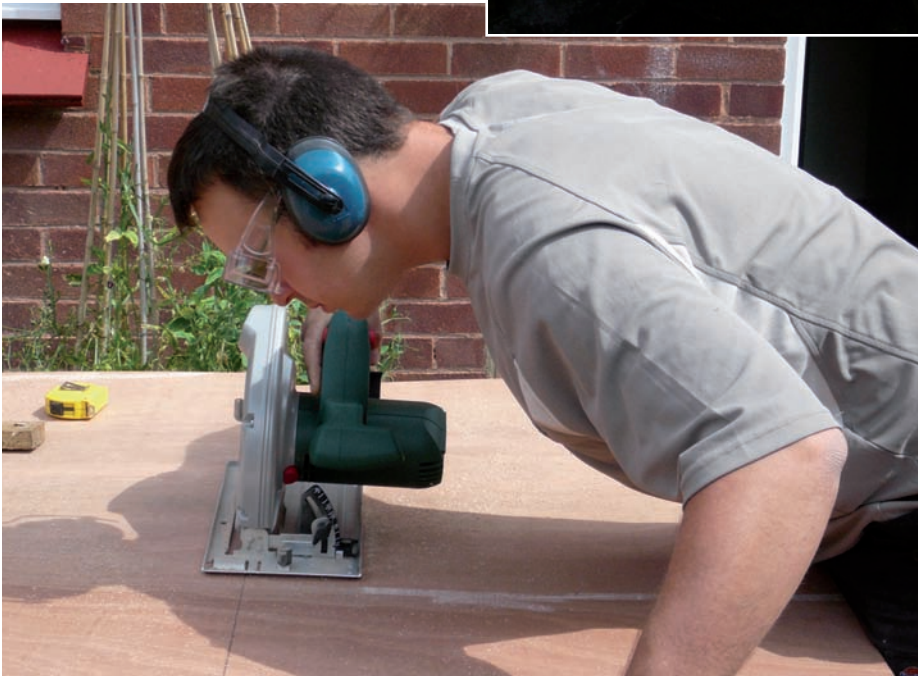
Split your sheet into four equal quarters 1220mm x 610mm.