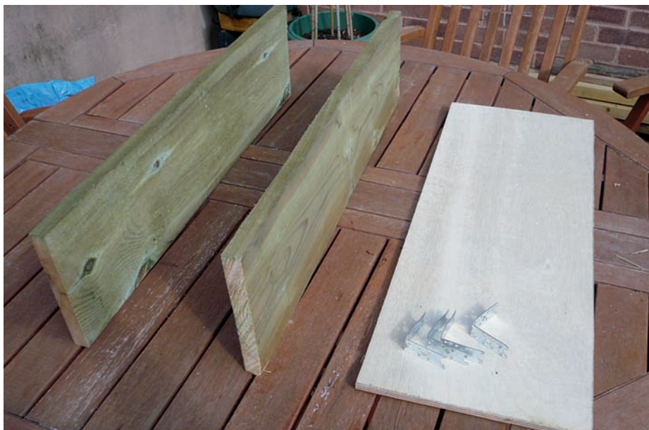
Cut four 100mm lengths of fixing strap and bend each strap then open back out to form right angles.

The tunnel's dimensions need to take account of the type of trap you intend to use. This guide assumes the raft operator will be using a Rhemo Products live catch cage trap. (The dimensions of a Rhemo trap are 600mm long x 180mm wide x 160mm high.) Cut two 660mm lengths of 25mm x 75mm gravel board. These two pieces will form the tunnel sides. Next cut a sheet of 10mm plywood to give you a piece 660mm long x 250mm wide. This will form the tunnel roof. To attach the tunnel to the raft use off-the-shelf right-angle brackets, or if you're making a large batch of rafts consider making your own. If the latter, using a pair of tin-snips, cut four 100mm lengths of fixing strap. Bend each strap across the middle so that the two ends align. Open the straps back out to form right angles.